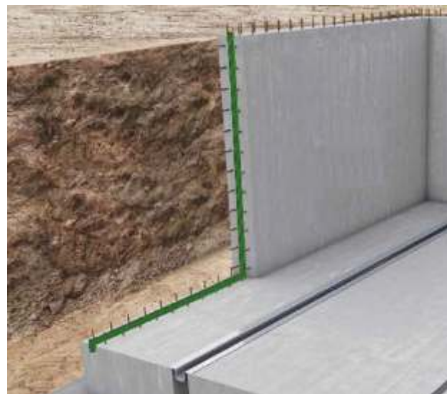
Construction joint internal