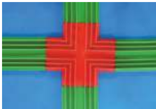
Cross - Piece Flat

The special pieces for the waterstop types WM D250 /30 and WM D320/20 are with monoblock technology